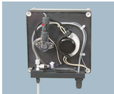
Sample Flow System